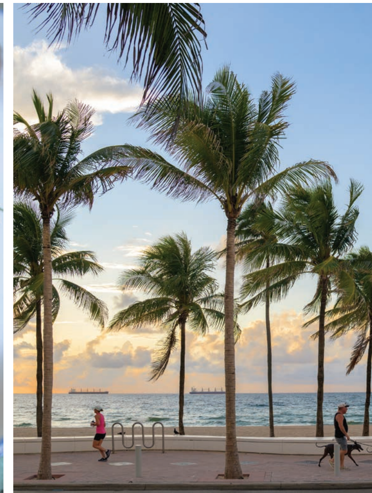
FORT LAUDERDALE OFFERS A BALANCE OF LAID-BACK BEACH LIFESTYLES AND VIBRANT URBAN ACTIVITIES