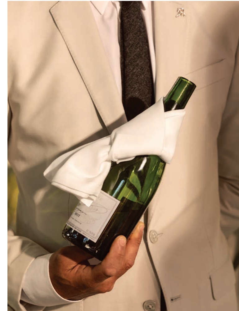
ST. REGIS ANTICIPATES EVERY NEED AND INVIGORATES ALL THE SENSES