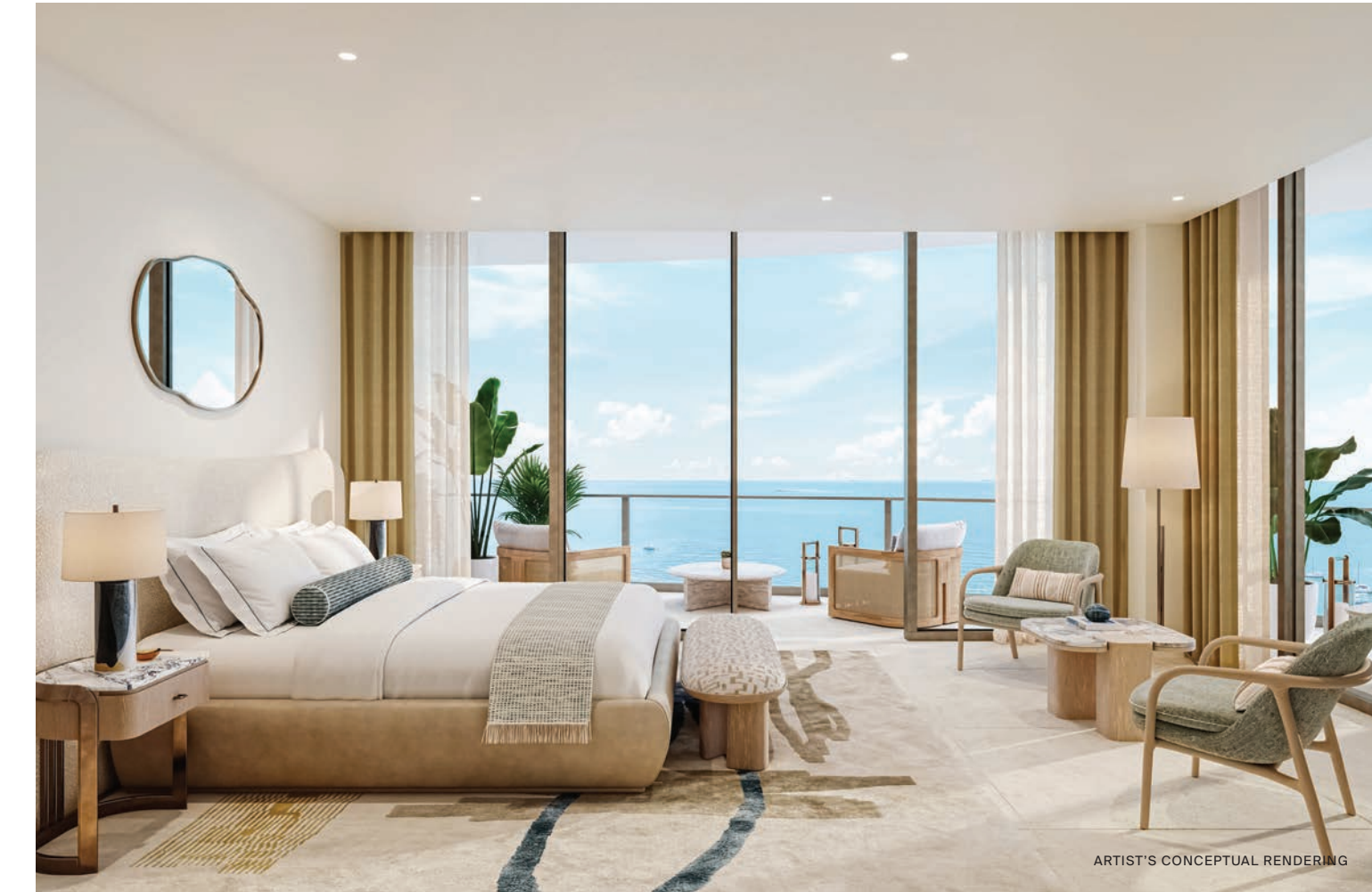
SEDUCTIVE, LIGHT-FILLED INTERIORS DESIGNED BY TARA BERNERD & PARTNERS