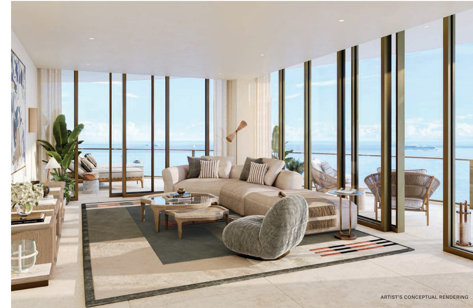
SWEEPING VIEWS OF THE BAY AND THE OCEAN ARE TRULY RESTORATIVE